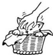
Exercise B ◆ Clumsy Petting