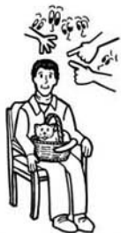
Exercise G ◆ Crowded and Petted by Several People