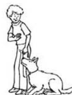
Exercise 9 (med./large dogs) Down on Command