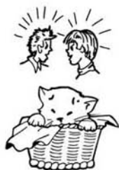
Exercise E Angry Yelling Assistant yells, then calms down and calls animal