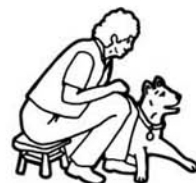
Exercise C ◆ Restraining Hug