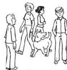
Exercise 6 ◆ Walk Through a Crowd