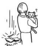
Exercise 7 Reaction to Distractions One visual and one auditory