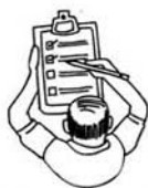
Exercise 1 Review Handler Questionnaire

◆ Indicates exercises used in evaluating complex area placement