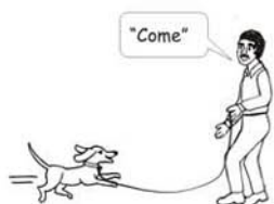
Exercise 11 Come When Called All dogs must do