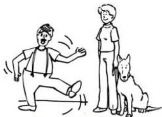
Exercise D Staggering, Gesturing Assistant staggers, then moves normally to pet animal