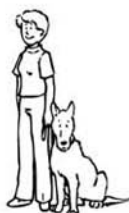
Exercise 8 (med./large dogs) Sit on Command