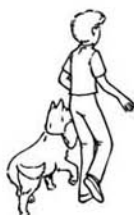
Exercise 5 ◆ Out for a Walk All dogs must walk on floor