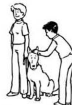
Exercise 3 Accepting Petting Animal may change position