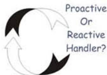
Exercise J ◆ Overall Assessment