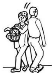
Exercise F Bumped from Behind