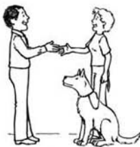
Exercise 2 ◆ Accepting a Friendly Stranger Animal may change position