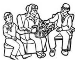
Exercise 8 and 9 (small dogs/cats) Animal Passed to 3 Strangers