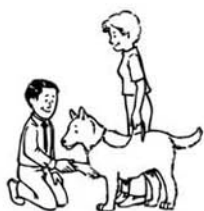
Exercise 4 ◆ Appearance and Grooming Animal may change position