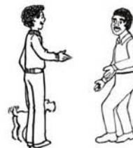
Exercise I Offer Treat